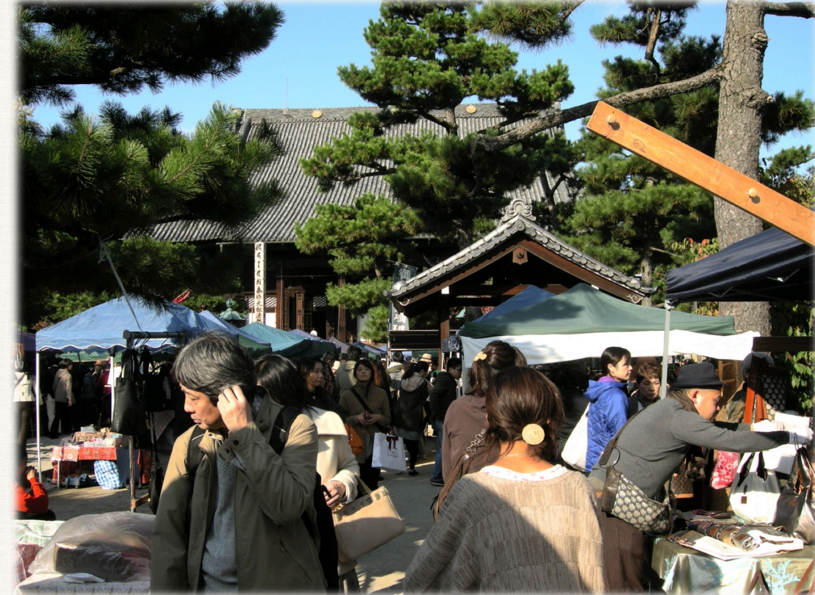
Handicrafts boom: Tezukuri-ichi market in Kyoto