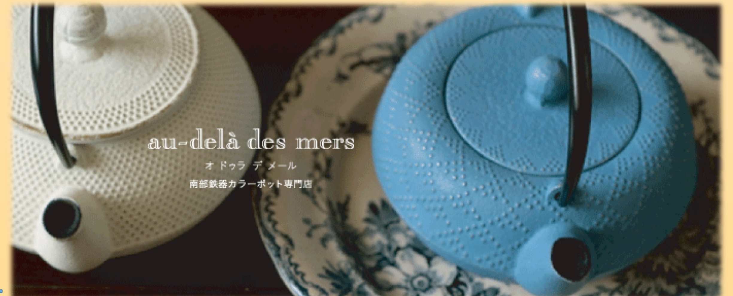
Nambu Ironware for an export market