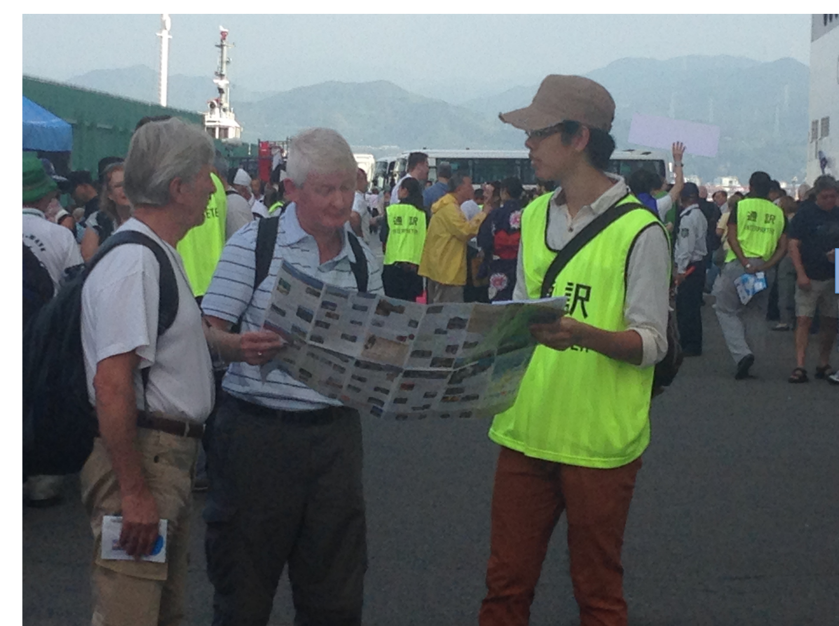
Helping people from around the world built confidence in the students' English skills.