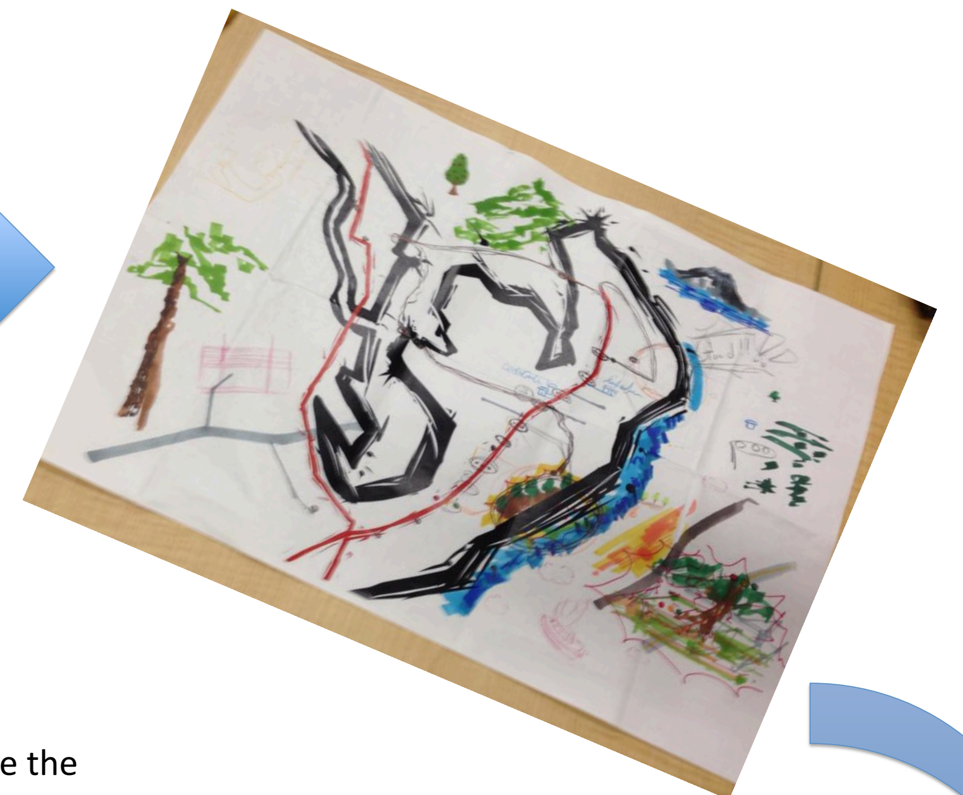
They analyzed other English maps of the town and identified points that needed clear explanations for foreign visitors such as taking a bus or taxi. Those were incorporated into the map.