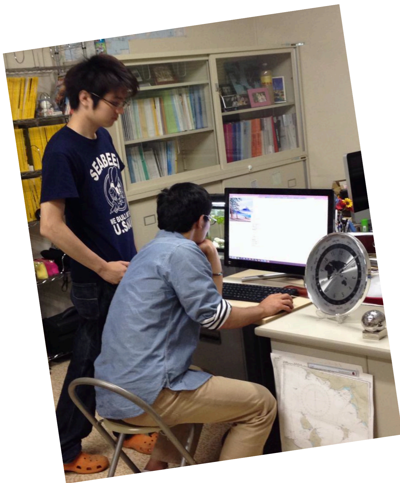
ATLAS students began by researching the local area to develop English explanations of the places of interest.