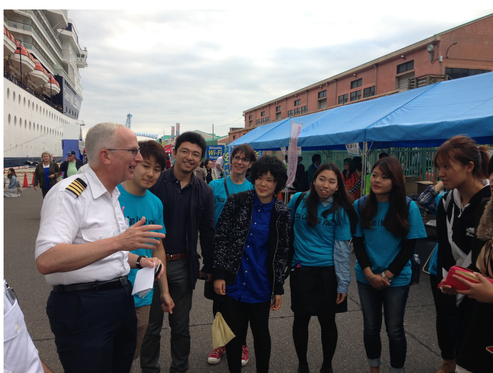
Talking with crew members introduced the students to new career options for skills they study in their majors at the Marine Sciences and Technology University.